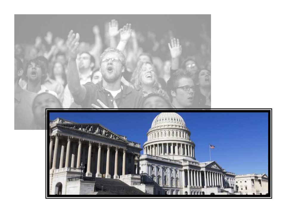
AWAKENING INDICATOR — Day Eight Prayer Focus Community and national leaders seeking out the church as an answer to society's problems